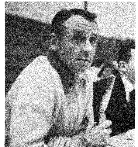
"And yours truly from Santa Monica ..."